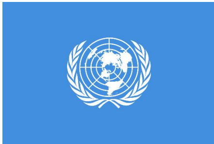
The Flag of the United Nations

civilization = human culture and achievements