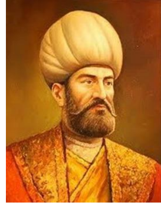
“Ahmet Muhiddin Piri” known as “Piri Reis”

In a later book, In Search of Ancient Gods (New York: Putnam, 1984), von Däniken sees additional "evidence" in a famous map created by a Turkish admiral, Piri Reis, in 1513. The map appears to include Antarctica, which was not discovered until 300 years later. Von Däniken believes that in 1513 map makers couldn't possibly have had the information shown in this map. He insists, "Whoever made it must have been able to fly and to take photographs." According to von Däniken, only one conclusion is possible: "To me it is obvious that extraterrestrial spacemen made the maps from space stations in orbit. During one of their visits, they made our ancestors a present of the maps."