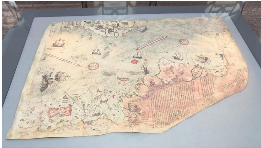
Piri Reis's Map in Public Display at Istanbul's Topkapi Palace