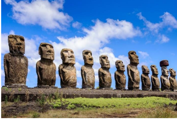
Statues of Easter Island