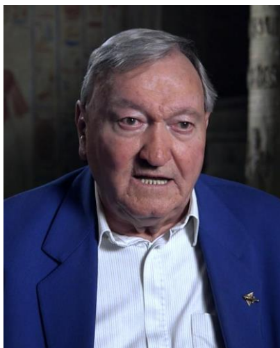
Erich von Däniken