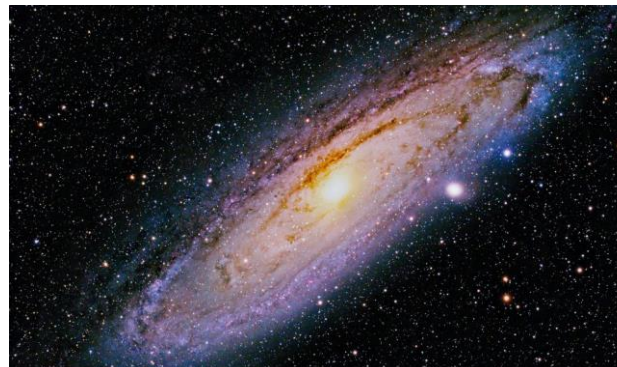
The Milky Way Galaxy