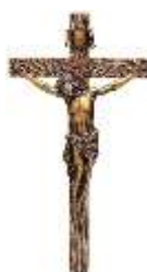
crucifix = cross

This law dates from the seventeenth century.