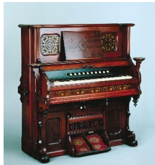
organ = a musical instrument